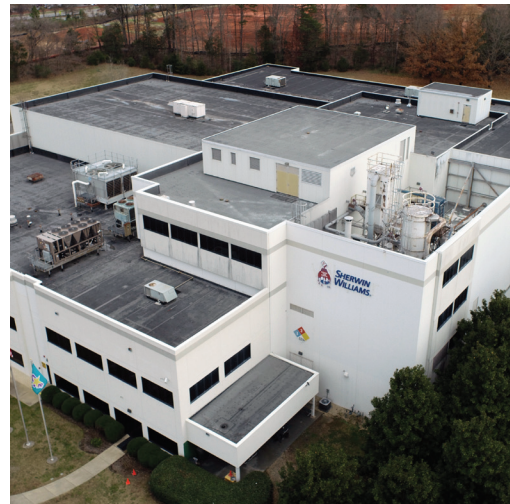
Manufacturing Plant - Before

Uniflex Fluid Applied Roofing Systems provides protection for the service life of the facility. The fluid-applied system is installed onto existing roofs. After the initial warranty term, typically 10-20 years, the warranty can be renewed for 10+ year terms indefinitely, with subsequent reapplication of the coating. No need to tear off, no filling landfills with waste and no landfill fees.