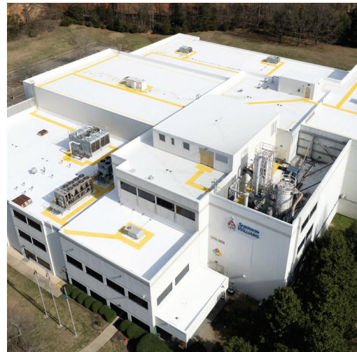
Manufacturing Plant - After