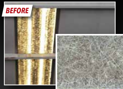
Fiberglass skylight BEFORE

Raised fiberglass hairs indicate age. Restore with UNIFLEX Skylight Restoration Coating.