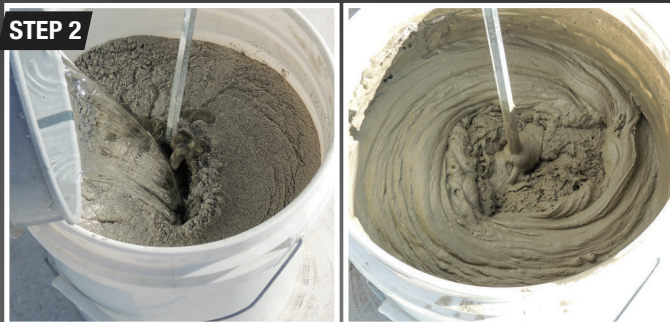
ADD WATER AND MIX THOROUGHLY.