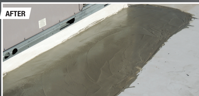
ONCE, KST® ROOFING SOLUTIONS SLOPE BUILDER IS CURED, COAT OVER.