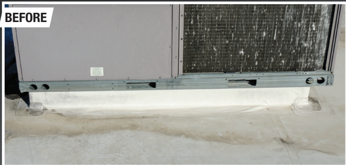
AREA OF PONDING WATER AT HVAC CURB.