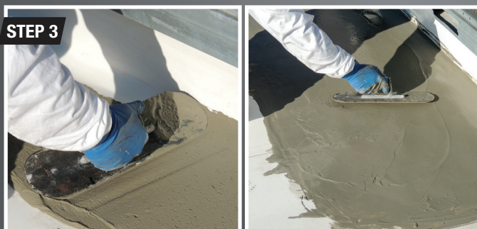
APPLY KST® ROOFING SOLUTIONS SLOPE BUILDER TO LOW-LYING AREA AND TROWEL, BROOM, OR SQUEEGEE INTO PLACE.