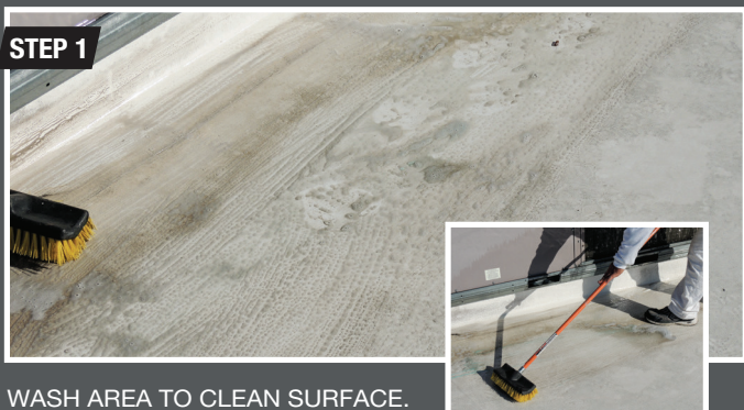
WASH AREA TO CLEAN SURFACE.